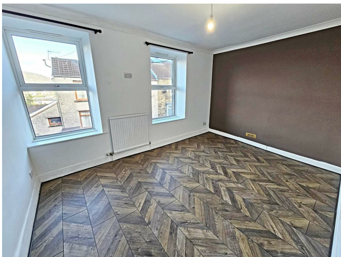
Bedroom 1 13'4" x 8'11" (4.08 x 2.74)